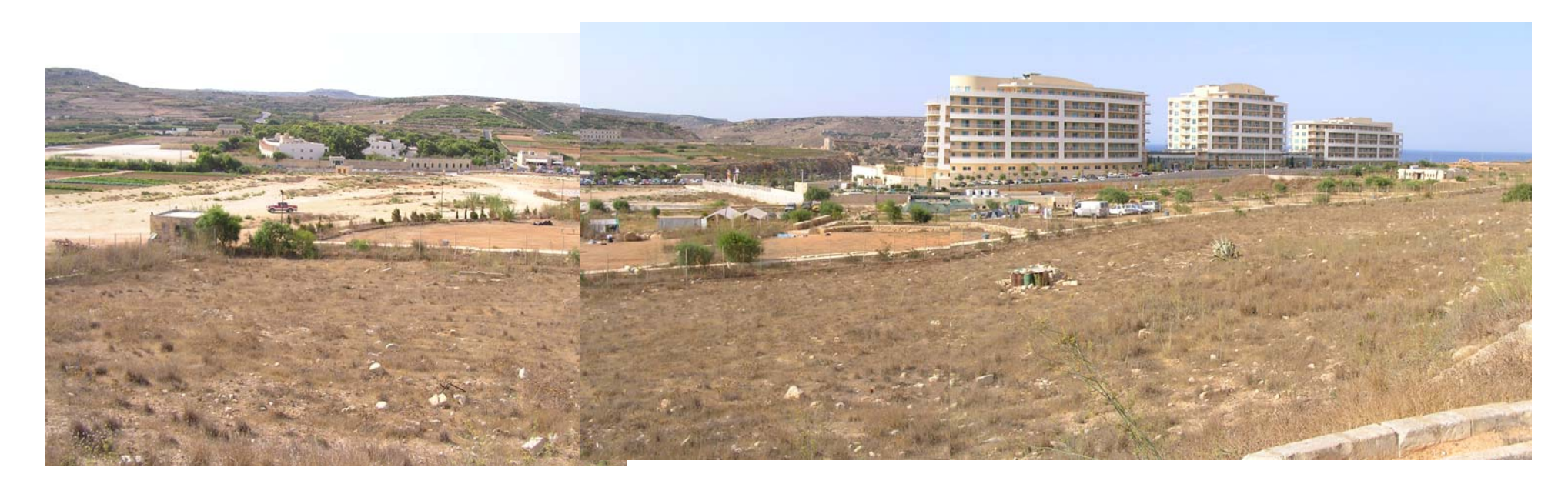
Image 17: View from Military Complex towards Tourist Complex and Golden Sands Hotel