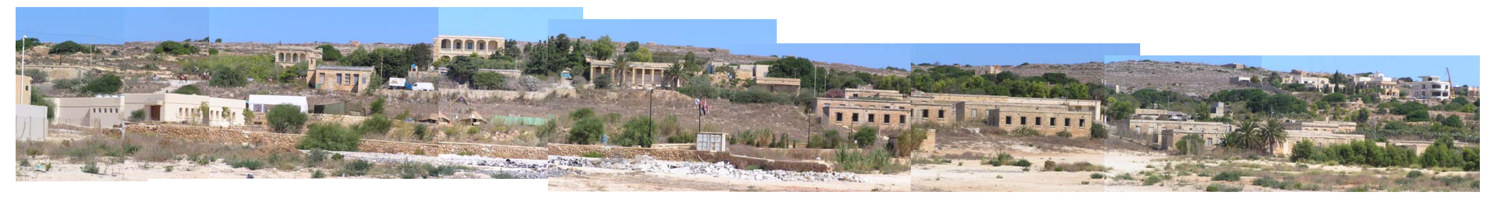
Image 18: View towards Military Complex from southern boundary of Scouts Camp