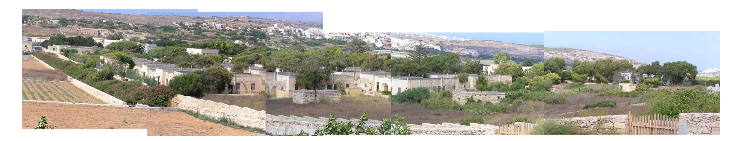
Image 19: View from Ghajn Tuffieha Car Park towards Tourist Complex